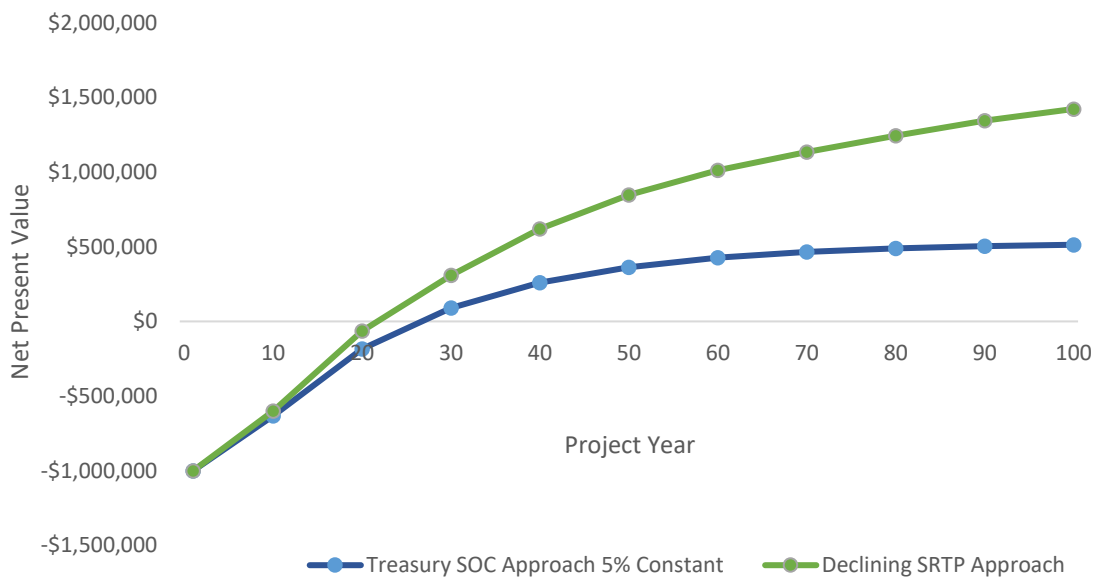
Figure 6-1: Illustration of effect of discount rate choice on Net Present Value estimates

benefits flattens off substantially from about year forty. An implication worth noting, concerns the difficulty in how the government recommended discounting regime can be considered consistent with long-term environmental policy expenditure, in particular for climate mitigation. While for the STRP rate, the value of addition benefits has a material contribution to the CBA decision metrics. To support practical application, discount factors are reported in Table A-1. These are essentially weights that can be applied to future values. Multiply a cost and/or benefit occurring in a particular year, with the discount factor for that year to retrieve its discounted PV. For example, $50 in 30 years time has a PV = $17 ( \$50 \times 0.3382 ).